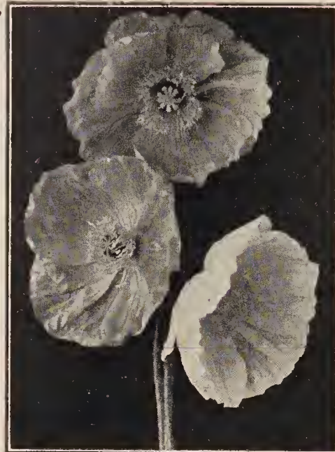
Iceland Poppy, Sanford's Giant

SANFORD'S GIANT STRAIN MIXED. The finest strain we have ever seen. The flowers are immense silken cups in a great variety of shades from the lightest pinks and creams through salmon and scarlet. The length of stem is another outstanding feature, many of them being 2 to 2½ feet.